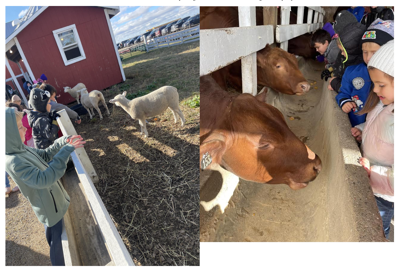
Our kindergarten students enjoyed a wonderful trip to Gust Brother Farm this week.