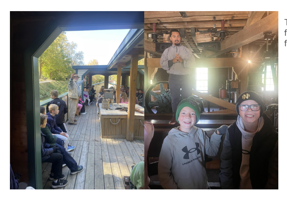
The 4th graders also enjoyed a fun canal experience on their field trip this week.